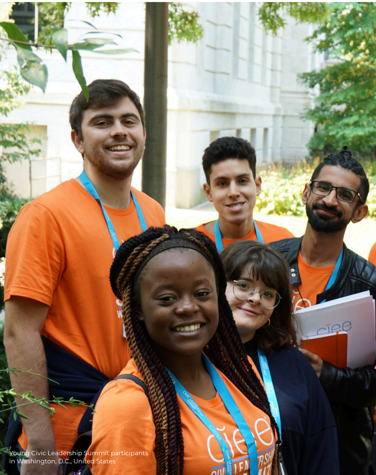
Young Civic Leadership Summit participants in Washington, D.C., United States