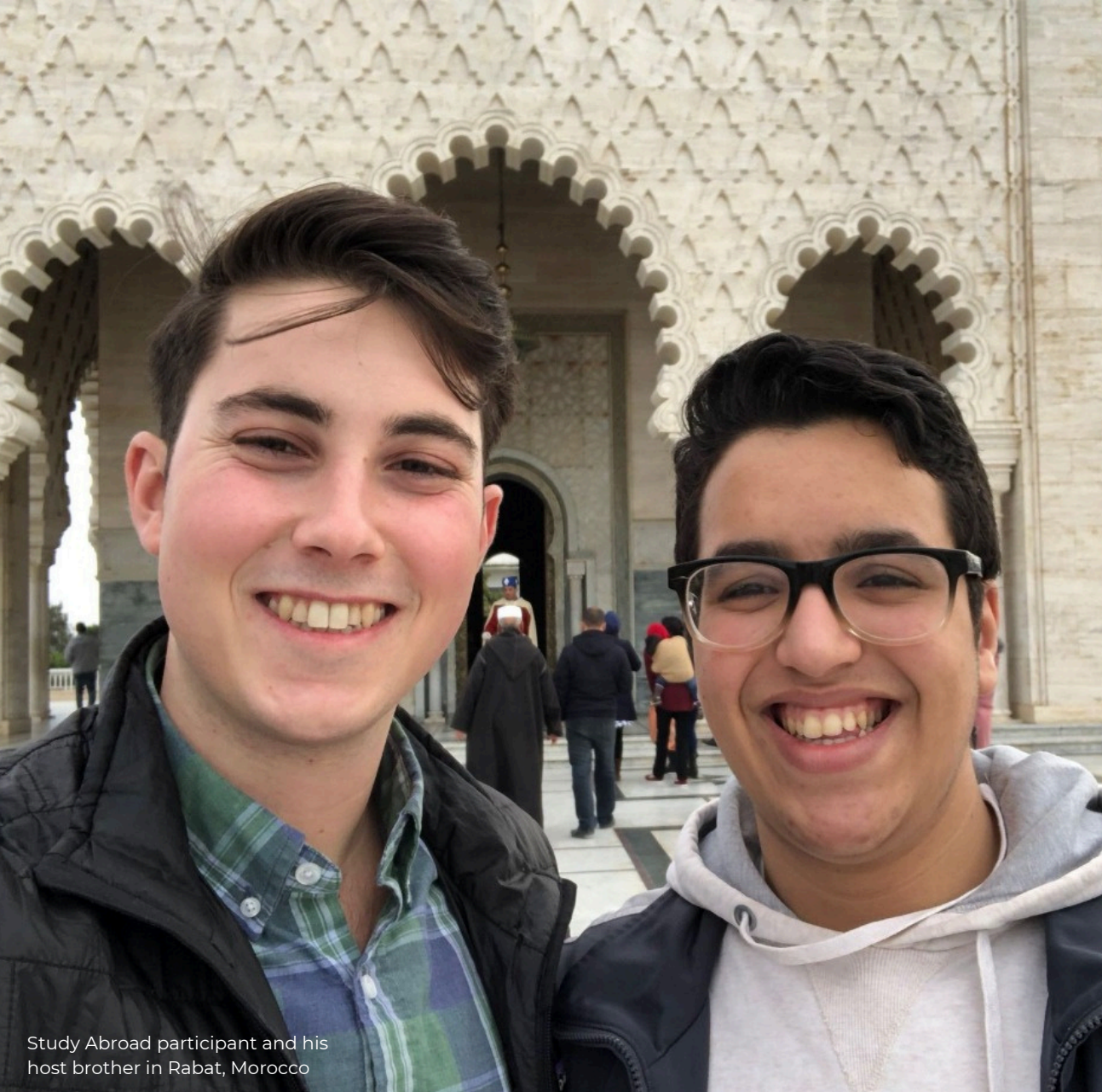
Study Abroad participant and his host brother in Rabat, Morocco