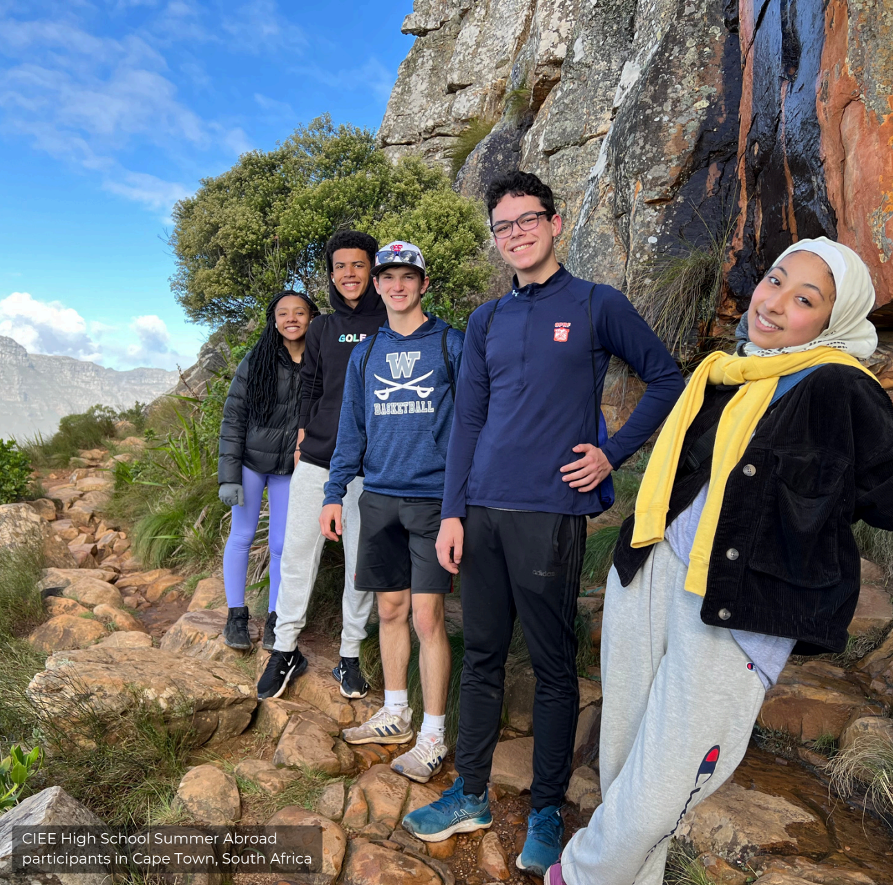
CIEE High School Summer Abroad participants in Cape Town, South Africa