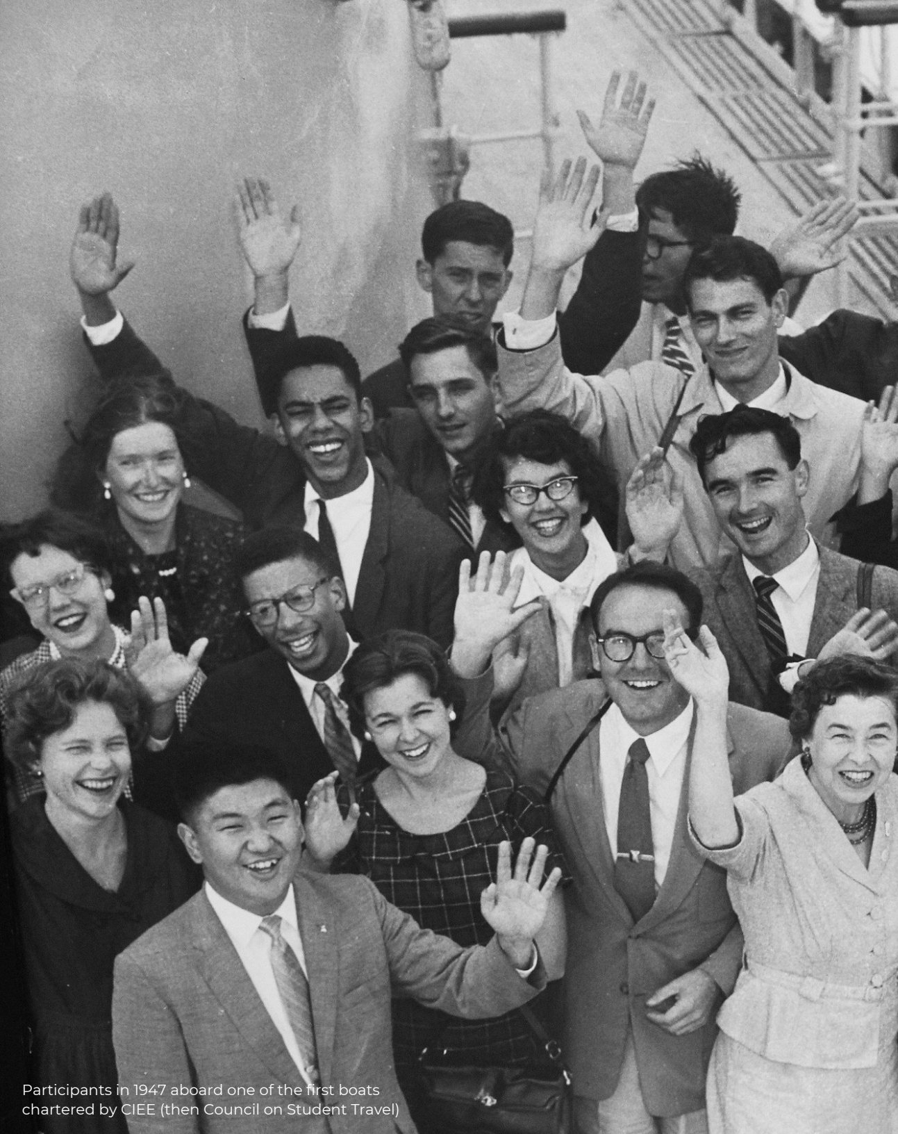
Participants in 1947 aboard one of the first boats chartered by CIEE (then Council on Student Travel)