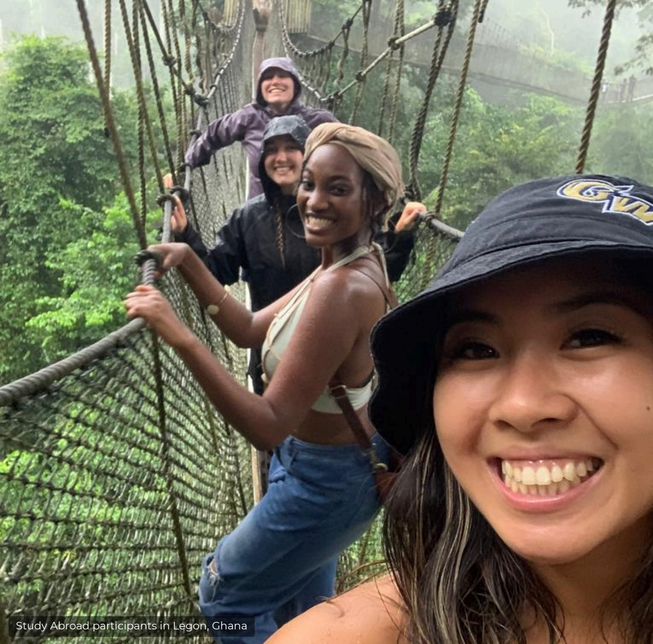
Study Abroad participants in Legon, Ghana