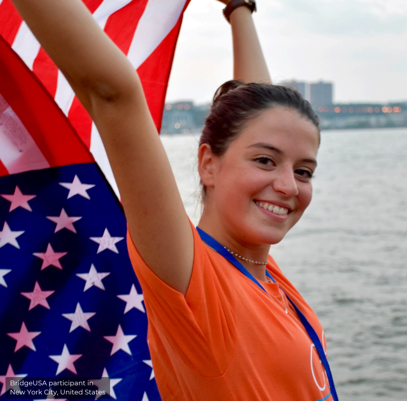
BridgeUSA participant in New York City, United States