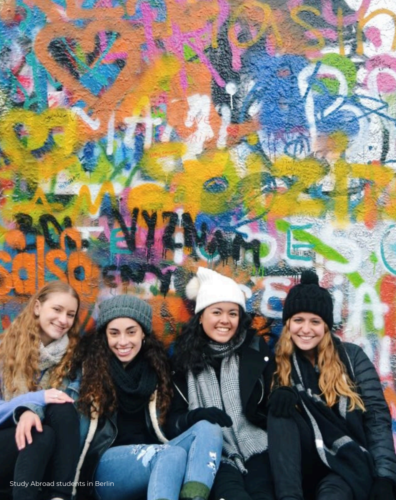
Study Abroad students in Berlin