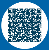
CHART YOUR COURSE